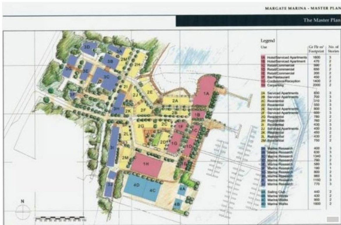
Map F2 Margate Marina Specific Area Plan – LISTmap

Open the full map extent (link to the interactive map )