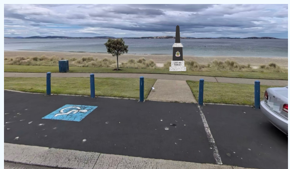
Option 2 - Obelisk