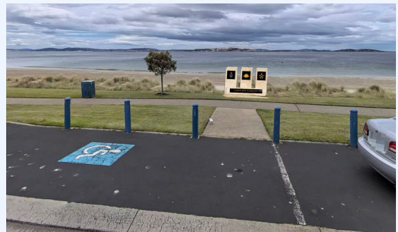
Option 1 - Sandstone Panels

The Kingston Beach RSL Sub Branch have agreed to pay for the design and construction of the memorial and will request that Council installs the memorial. This will be subject to Council approval.