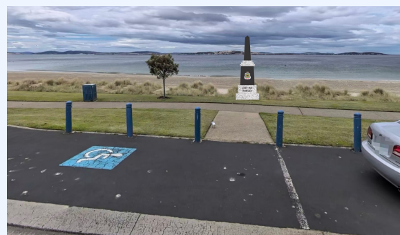
Option 2 - Obelisk